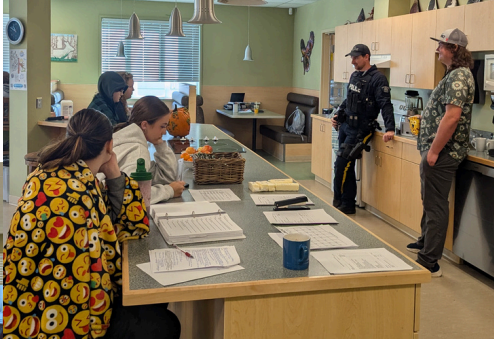
GAS has connected with their local police liaison officer. He stops in regularly to check in with our GAS students and staff. He will also be coming in monthly to answer questions about getting into the police force, his "why" and duties of the job.