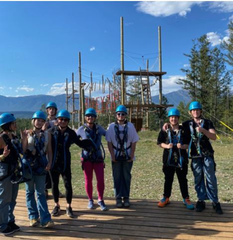
Open Doors Alternate School went zip lining at Valley Zipline on September 25