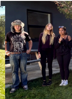
Group photos from the first day of school at KAS. Staff and students participated in a team building exercise to get to know one another.